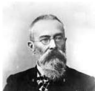
Nicolai Rimsky-Korsakov (1844-1908)