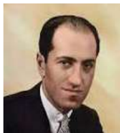
George Gershwin (1898-1937)